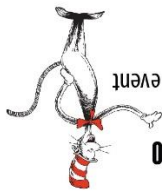
TABLE OF 10 | $1,750 | INDIVIDUAL TICKETS | $175 EACH